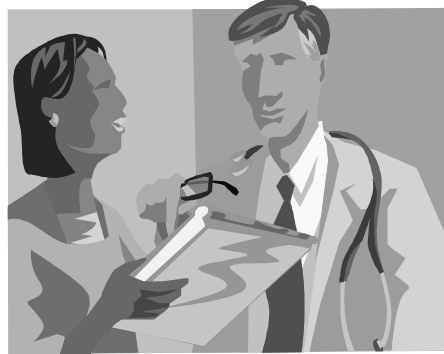
The patient and doctor relationship plays a vital role in mapping therapy protocols.

Note, too, that the purchase of a portable chamber should not replace the medical expertise of your doctor. You may be able to give yourself treatments at home (at a considerable cost-and-space saving advantage), but will still need to remain under the care of your physician, in order to best