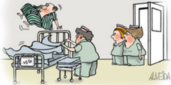
Nobody changes a bed faster than she does!