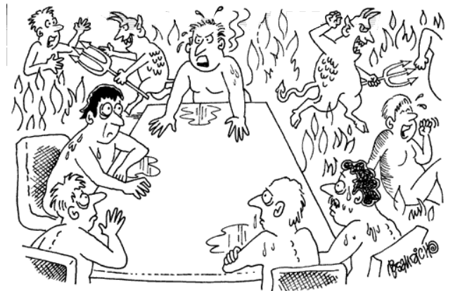
"It's quite a coincidence, isn't it, that we all served on the same medical review board?!"