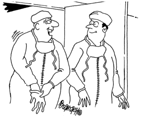
"I hear the patient is a malpractice attorney."