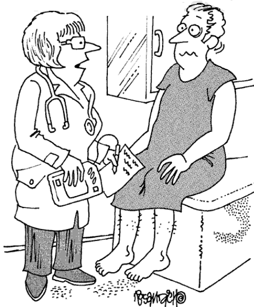
"There's some good news and there's bad news which totally refutes the good stuff."